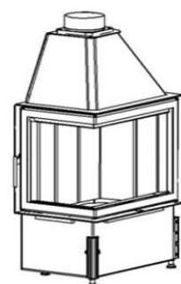
CHOPOK R90-S/450 L